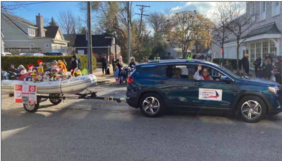
America's Boating Club Grosse Pointe in the Grosse Pointe Santa Parade

Official Publication of the Grosse Pointe Power Squadron