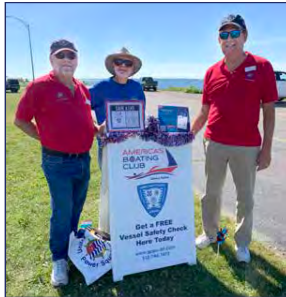
Signage for the Vessel Safety Checks

VOLUME 49 NO. 6 | September 2022 www.gpps-d9.com