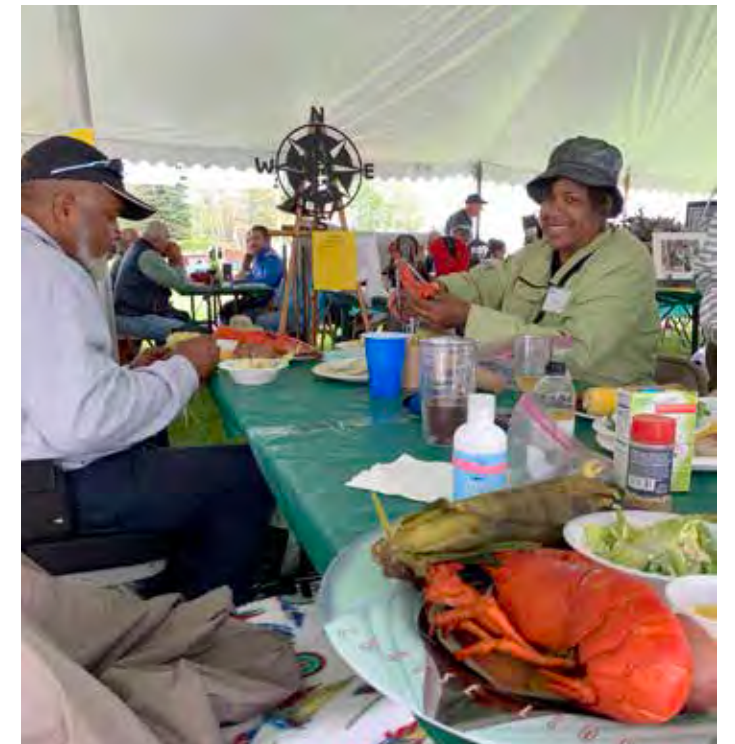
The Dunbars enjoying lobster fest with auction items in the background.

The author, publisher, or seller assumes no liability with respect to the use of information contained herein.