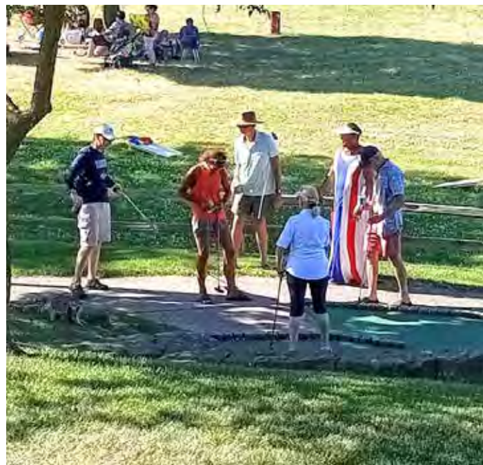
Putt-Putt at the New Member Party at MetroPark

The author, publisher, or seller assumes no liability with respect to the use of information contained herein.