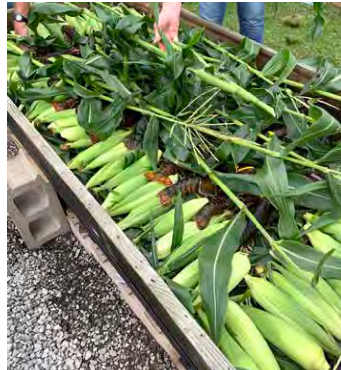
Layering of stalks, corn, lobsters and more stalks before adding wet newspaper to steam them.