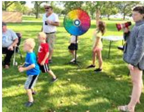
Kid's Games and Activities