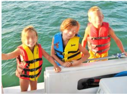
Beautiful Boats & Cute Kids