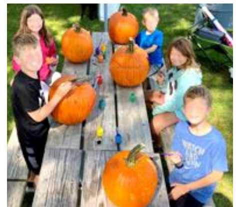
Kids Painting Pumpkins