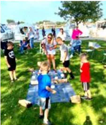
Trees & Shade Play Areas