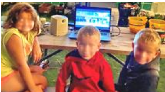
Kid's Movies in the Tent