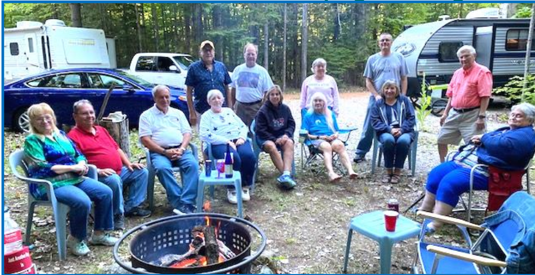
Dearborn Sail and Power Squadron/America's Boating Club members camping in the Roger's City area the night before the Alpena Shipwreck Cruise on Thunder Bay.