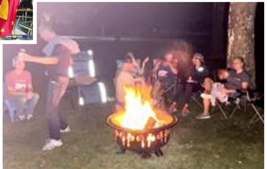
Perfect Ending to a Busy Day at the Marina