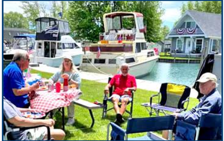
Anchor Bay members at the NCYC, June 2022