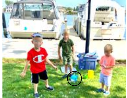
Blue Whale Bubbles