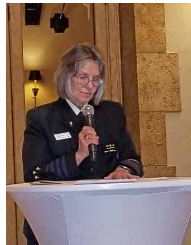
Rose moment of silence