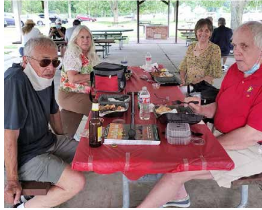
{\it The author, publisher, or seller assumes no liability with respect to the use of information contained herein.} \\ {\it Photographer: Lt/C Rose Stano}